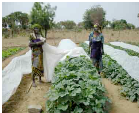
Super Vegetable Garden in Niger