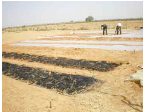
Biochar application in Senegal