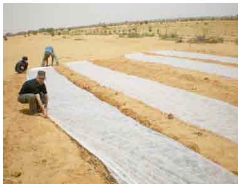
Setting up of veils