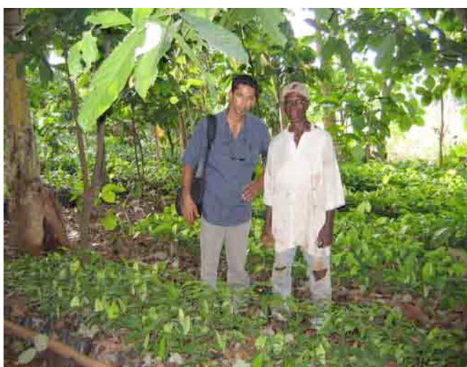
Pro-Natura agroforestry development centre in Nigeria

Agroforestry was once a specific traditional type of agronomy practiced by rural communities in the tropics. A rational land-use system that restores and maintains soil fertility, it increases total yield, involving agricultural crops (food-producing annuals) in synergy with trees (perennials) and/or animal husbandry, all on the same land and in varying combinations over time. It should be reintroduced without upsetting the ecological and socio-economic balance of a given local population.