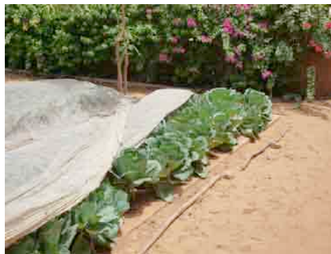
Production of cabbages in the city of Niamey