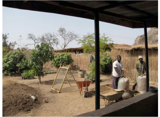
Nursery at the APLORI

The implementation of such a pilot project including agroforestry activities is extremely relevant for its adoption and up scaling in other Nigerian locations and natural reserves such as the Yankari and Kamuku National Parks. ■