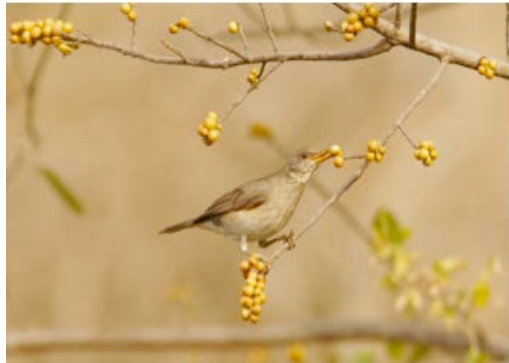
Turdus pelios and Cinnyrinclus leucogaster eating figs of a Ficus thonningii