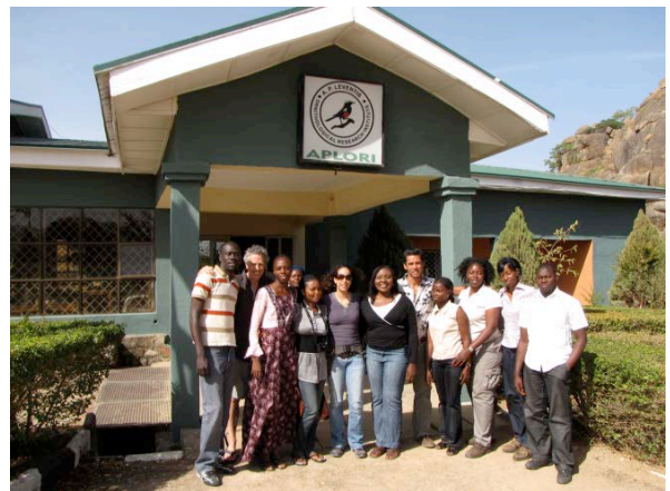
APLORI / Pro-Natura / University of Florida team, Jos 2011

We carried out the agroforestry systems and Vegetable Production to enhance Food Security amongst Communities Surrounding the APLORI between 2012 and 2013 with support from the Social Development Fund of the French Embassy in Abuja. The project benefited more than 500 farmers from Laminga, Kerker and Zarazon communities of which 100 directly benefited from agroforestry training and vegetable production support.