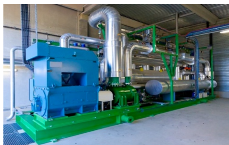
Example of ORC made by Enertime

CarboChar-3 and 4 can also co-generate electricity. They respectively produce 1MW and 2MW of sustainable heat that can be converted into electricity with an ORC (Organic Ranking Cycle) technology transforming thermal energy into mechanical energy and finally into electricity through an electrical generator.