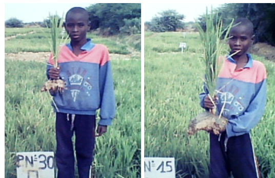
Rice without vs rice with biochar (Senegal)