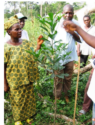
Pro-Natura training in Ivory Coast

ICRAF is the only institution that does globally significant agroforestry research in and for all of the developing tropics.