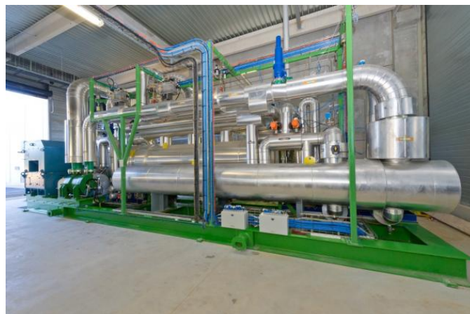
Example of ORC made by Enertime

Pro-Natura International UK • 29 Downside Crescent, London NW3 2AN