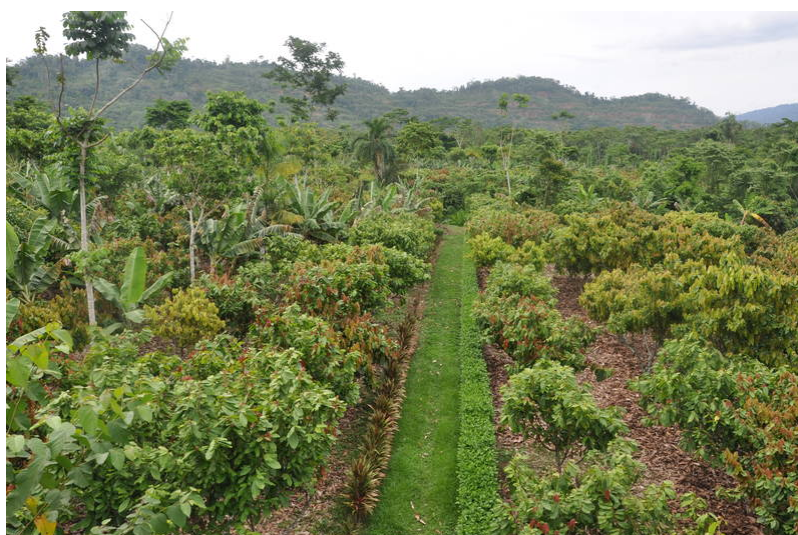
Cocoa agroforestry system