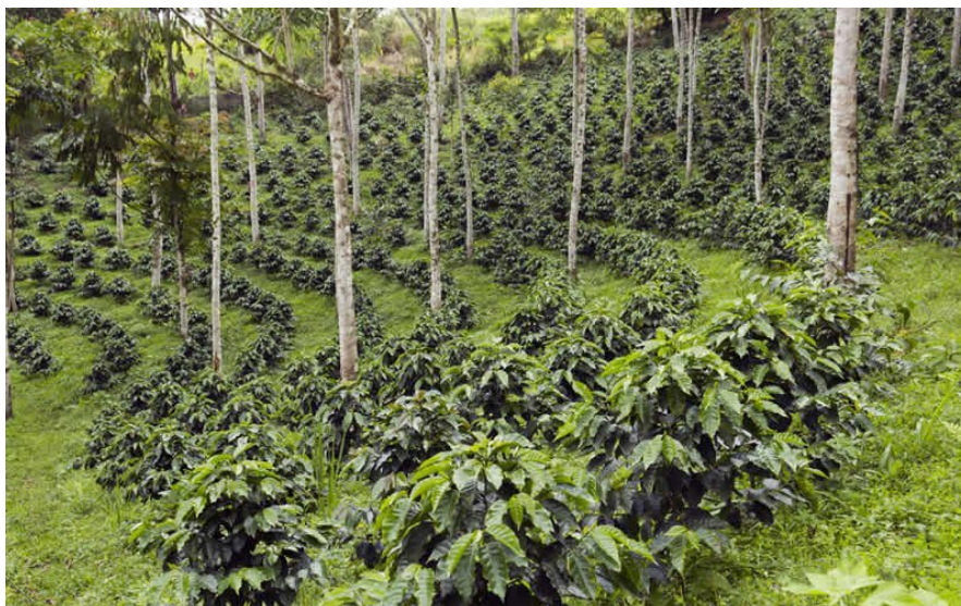
Coffee tree agroforestry system

Pro-Natura works in partnership with the International Centre for Research in Agroforestry (ICRAF), a global centre of excellence in science and development based in Nairobi. Our shared objective is to apply “Climate-Smart Agroecology” at an African scale to sequester 600 million tons of GHG over the next 20 years while improving the livelihood of 10 million farmers by a factor of three.